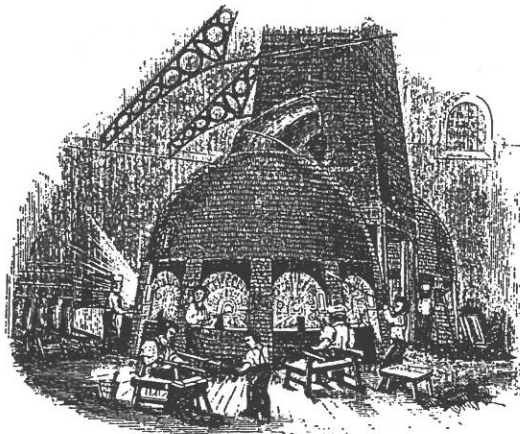
Elevation of the furnaces, and interior view of the Glass-house and working operations.

Catherine VAUDOUR Curator in the Museums of Rouen